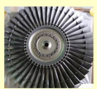
Detonation Spray Coated LPC III modules for Naval Aircraft