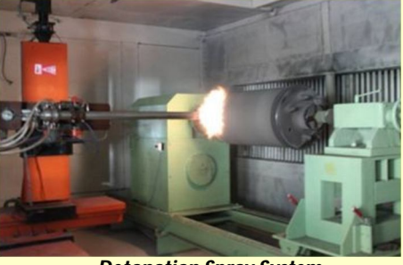
Detonation Spray System