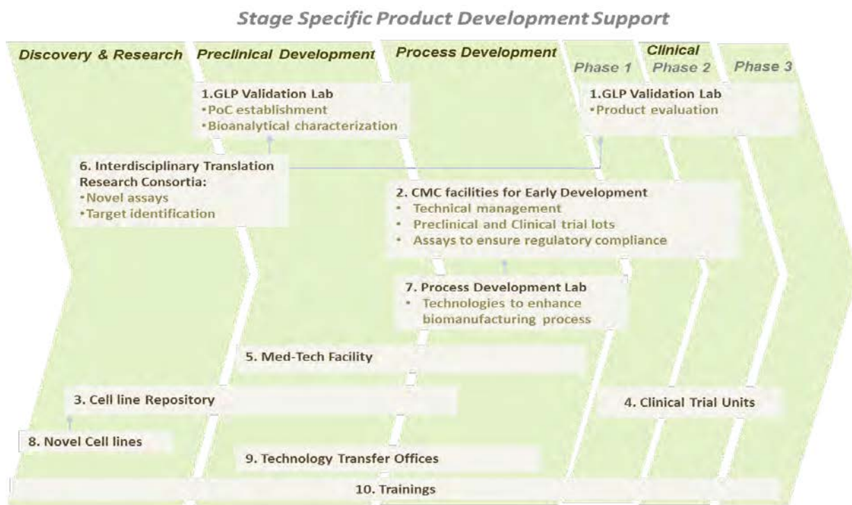
Figure 1: Prioritized components to accelerate development of products that could be in different stages

In parallel, the Program would create an enabling environment that would pave the way for the entire field, not just the Program supported products and establish a continuum foster future innovation. It would support development of novel assays for evaluation and discovery of products; technologies and platforms to enhance manufacturing capabilities, strengthen technology transfer capabilities and invest in building a task force of scientific leaders. (Figure 1: Component6-9)