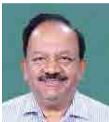
डॉ. हर्ष वर्धन DR. HARSH VARDHAN